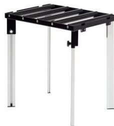
COLLAPSIBLE BENCH WITH ROLLERS For safe handling of large format paving