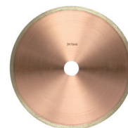
179CC350 BLADES For use with the Zoe 150 for cutting porcelain, ceramic and stone paving. This blade has a long life.