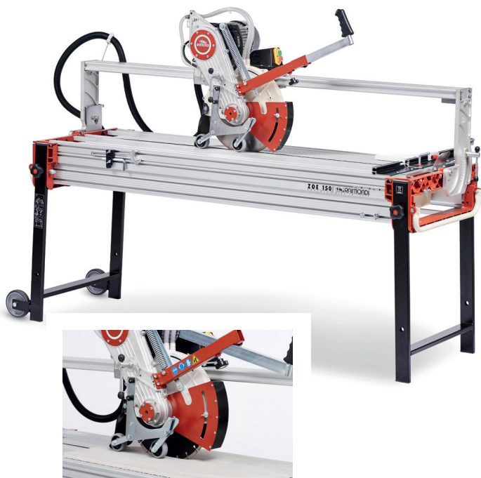
ZOE 150 BRIDGE SAW MACHINE

Porcelain Paving is best cut using a power saw, fitted with a good quality diamond blade which is water fed.